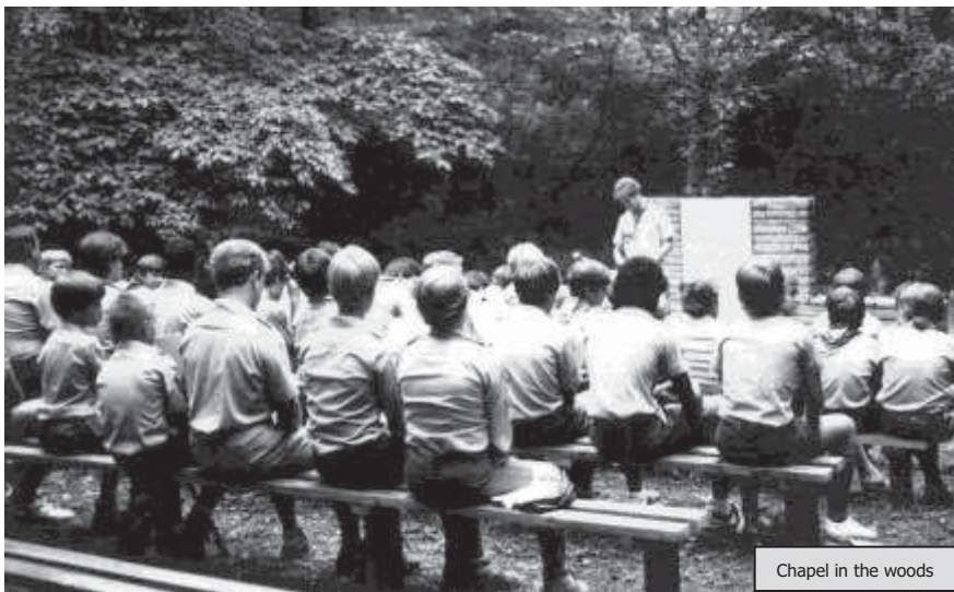
Chapel in the woods